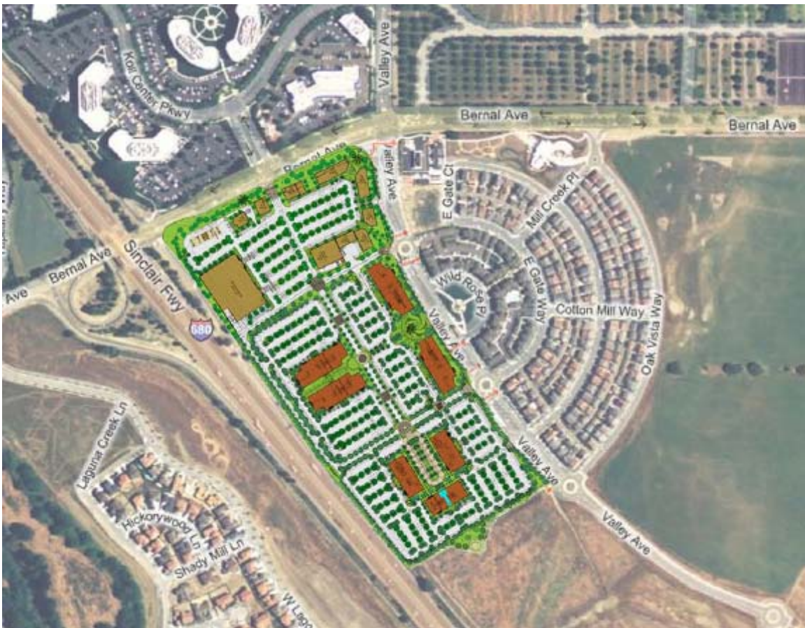
Figure 1: Aerial Photograph/Location Map of the Proposed Development and Surrounding Land Uses

An aerial photograph with the revised retail/commercial portion superimposed on the site with the office portion and the surrounding use and developments is shown on Figure 1, below.